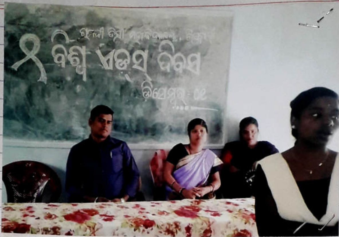
World AIDS Day 01/12/2019