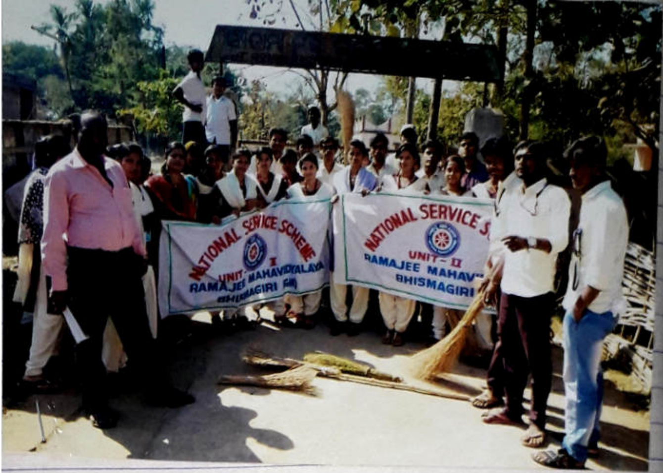
Special Camp - 2019-20