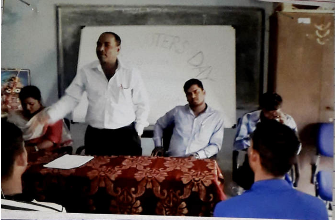
National Voters Day 2018-19