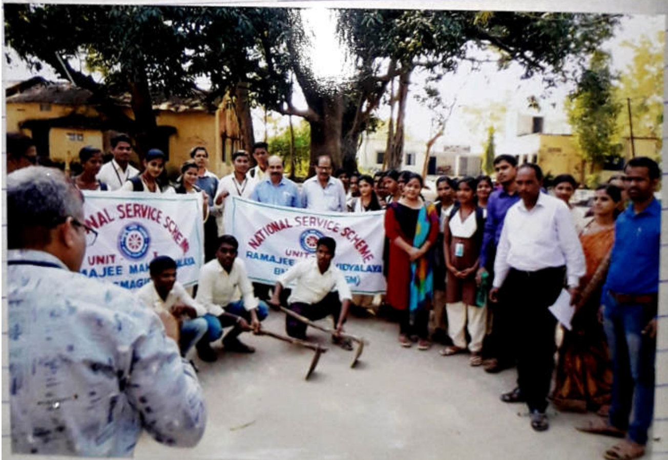
Special Camp - 2019-20